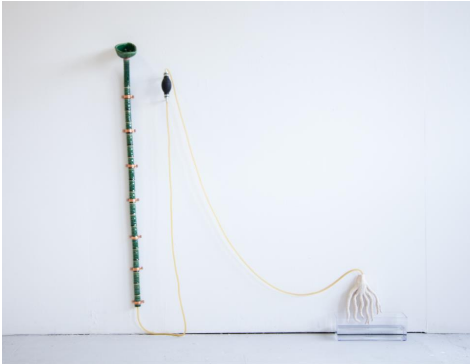
Emilia Gonzalez, Lean in Press Me Breathe , clay, distilled scent, medical rubber pump system, 150 x 150cm